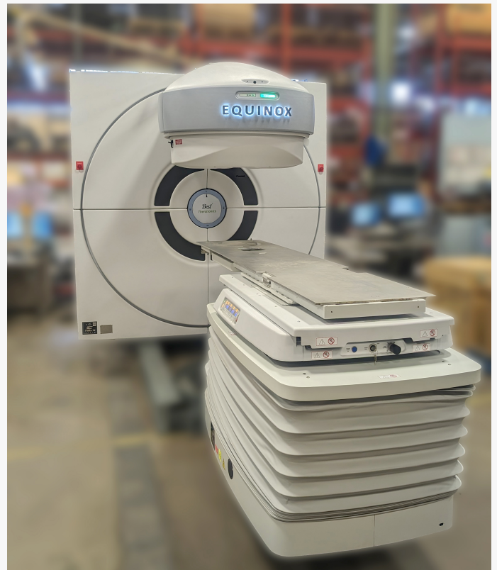
GammaBeam 100-300 CM Equinox in production.